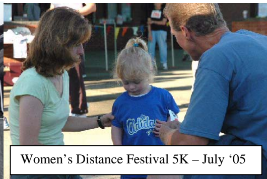
Women's Distance Festival 5K – July '05