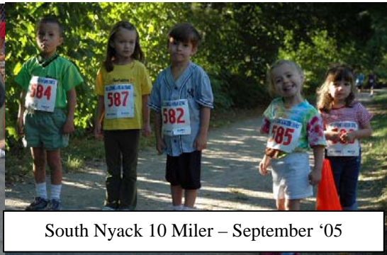
South Nyack 10 Miler – September '05