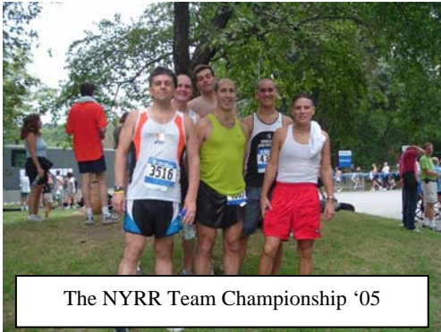
The NYRR Team Championship '05