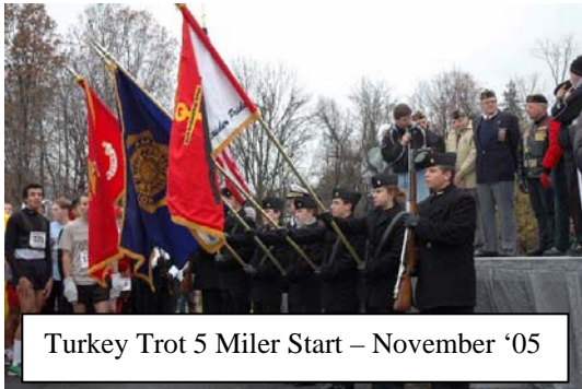
Turkey Trot 5 Miler Start – November '05