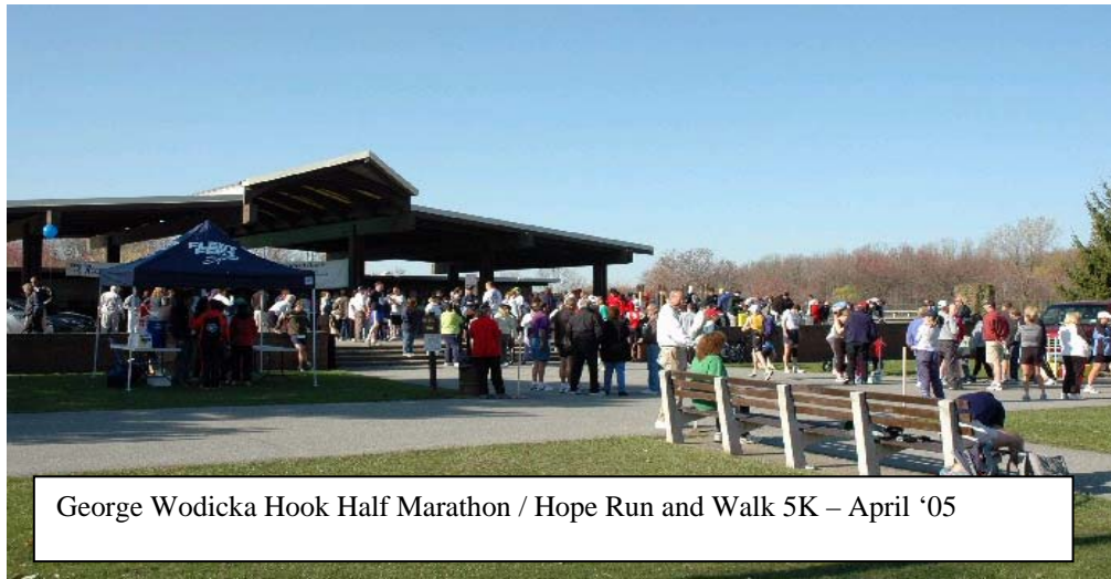
George Wodicka Hook Half Marathon / Hope Run and Walk 5K – April '05