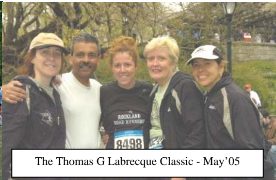
The Thomas G Labrecque Classic - May '05