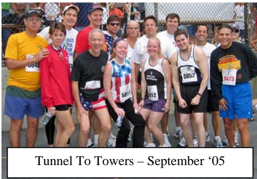
Tunnel To Towers – September '05